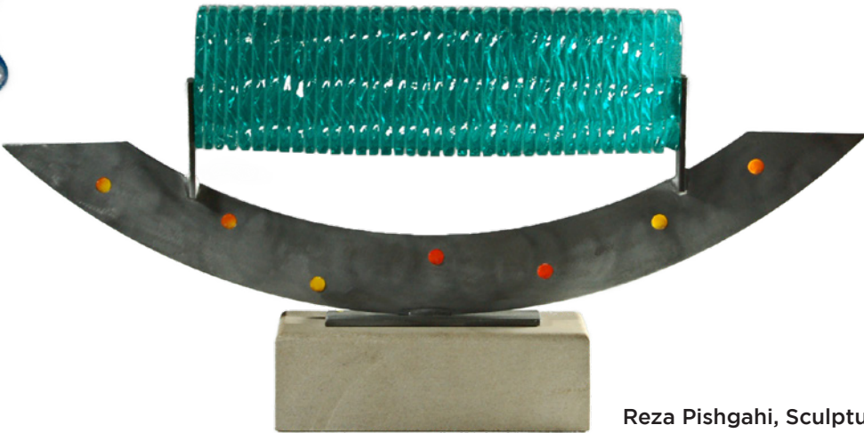
Reza Pishgahi, Sculpture