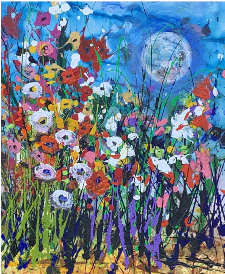
Jimmy Tucker, Painting